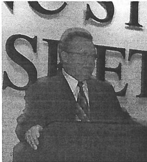
Pictured: Hurricanes GM Jim Rutherford at the podium during the March Membership Meeting.

"To our players credit, they came back really early and started working out in the first part of August. In hindsight, I wish they maybe would have stayed away until the first of September." Said Mr. Rutherford.