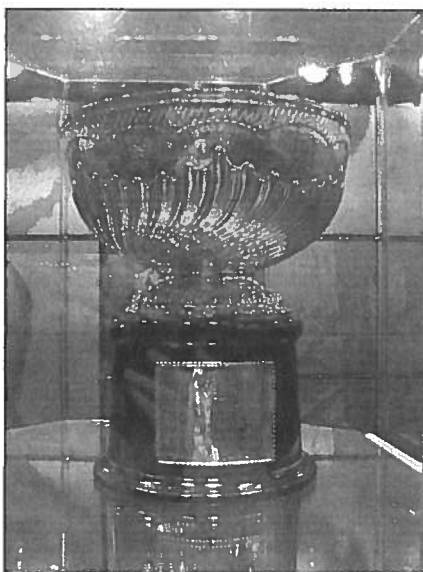
Pictured above: Direct from the "Vault" - The Original Stanley Cup

Our first stop in Toronto was Wayne Gretzky's Restaurant. I had a hamburger appropriately named "The Great One" given the theme of the restaurant. The food and drinks were ok, but for the price and quality, I'd recommend going to Gretzky's to see the memorabilia and have a few drinks. There are many great choices in Toronto for food.