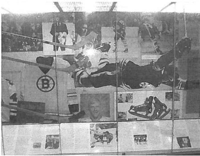
Pictured: The Bobby Orr display at the Hall of Fame chronicles the most famous goal in hockey!

The Hockey Hall of Fame is a great way to recover from the devastation of being ousted in the Playoffs and watching yet another team—that is not your favorite—hoist the Cup. To see and slightly experience the rich history of the sport, gives the fan a perspective on why the guys play and why we love to watch.